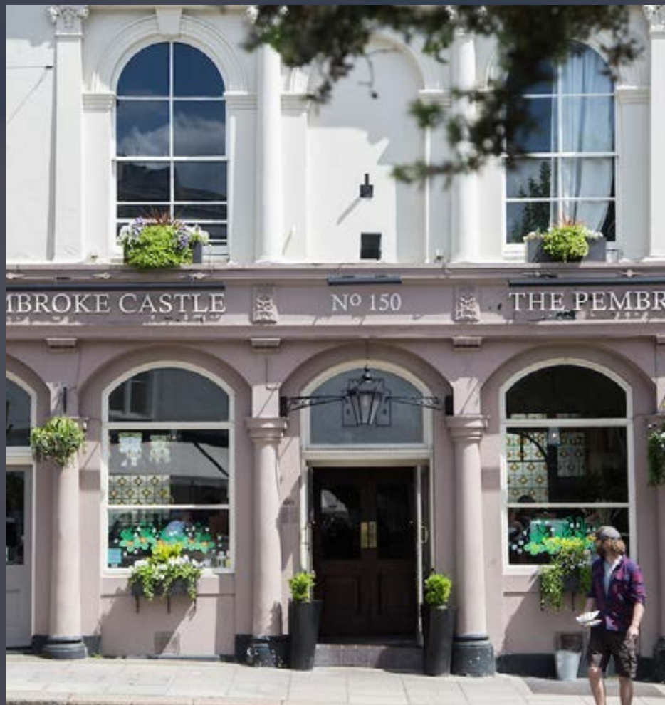
The Pembroke Castle

This property benefits from excellent transport links, with Camden Town underground station (Northern Line) and Camden Road British Rail station just a short walk away. Kentish Town and Mornington Crescent stations (both Northern Line) are also easily accessible. Kings Cross station is conveniently located nearby, offering fast and direct connections to Europe and the West End. Situated outside the congestion charging zone, the property provides hassle-free access to all parts of the city.