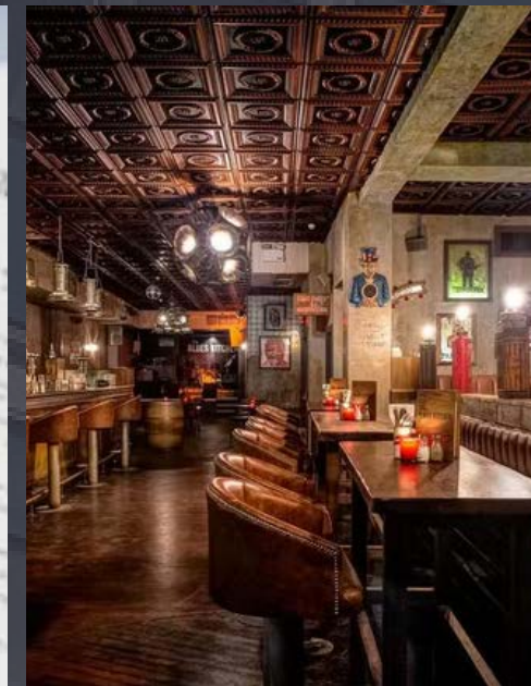
The Blues Kitchen